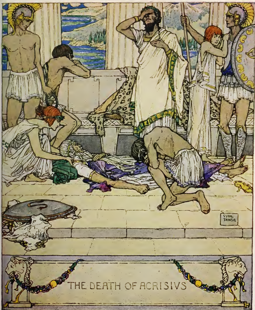
THE DEATH OF ACRISIVS